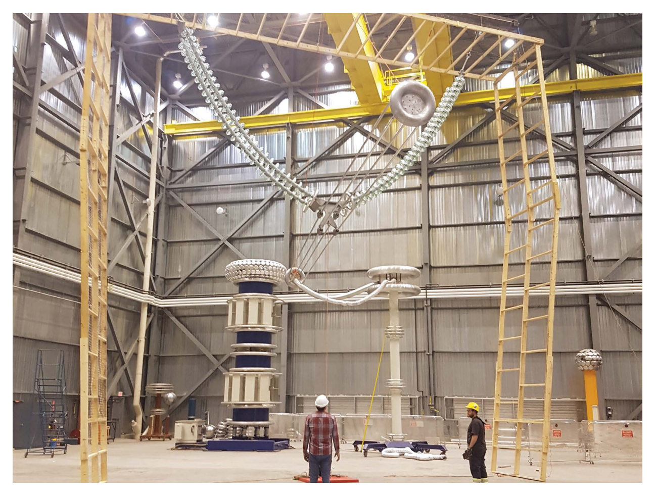
Visual corona and RIV testing on double v-string transmission line assembly.