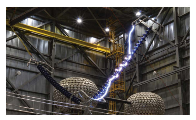
Critical Flashover Test (CFO) performed on a 500 kV AC transmission line arcing horn assembly.

We specialize in visual corona and radio interference voltage (RIV) testing. These tests are performed to determine the maximum conductor surface voltage gradient in kV/cm, where transmission line hardware is free from corona discharge and is not a source of RIV.